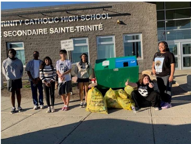
Adopt a Trail program