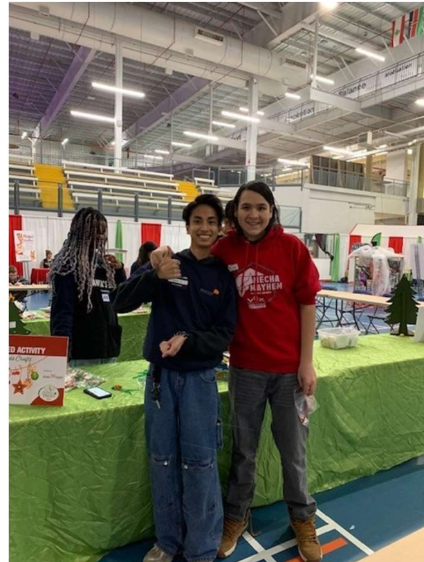
Festival of Trees